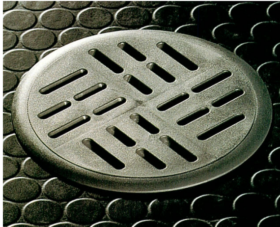
BLA mounted into a linoleum floor