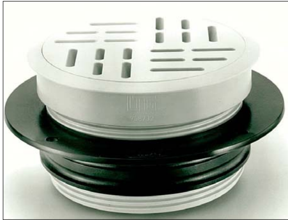
BLA with wall-to-wall carpet clamping ring