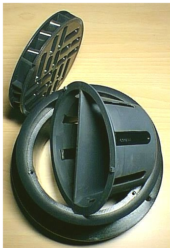
BLA disassembled: dirt-trap basket with air-side balancing via valve (black)