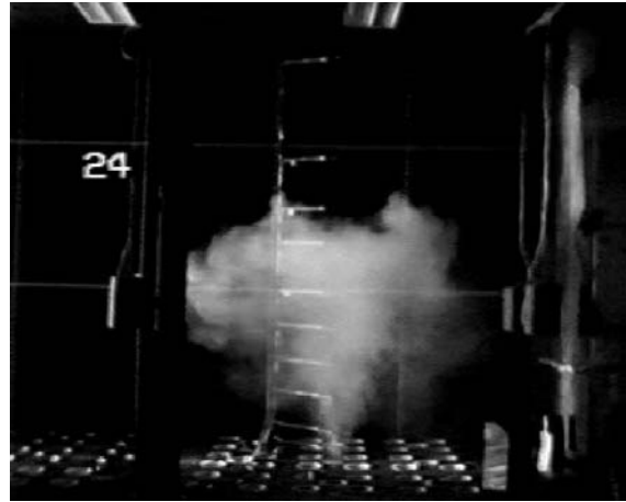
Air flow from BLA, great penetration depth, low air speeds