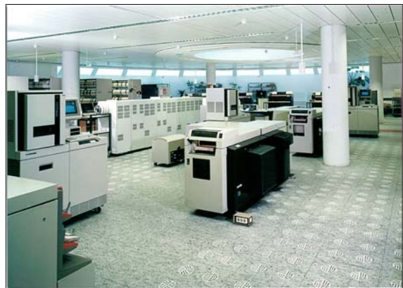
Example: Computer Center